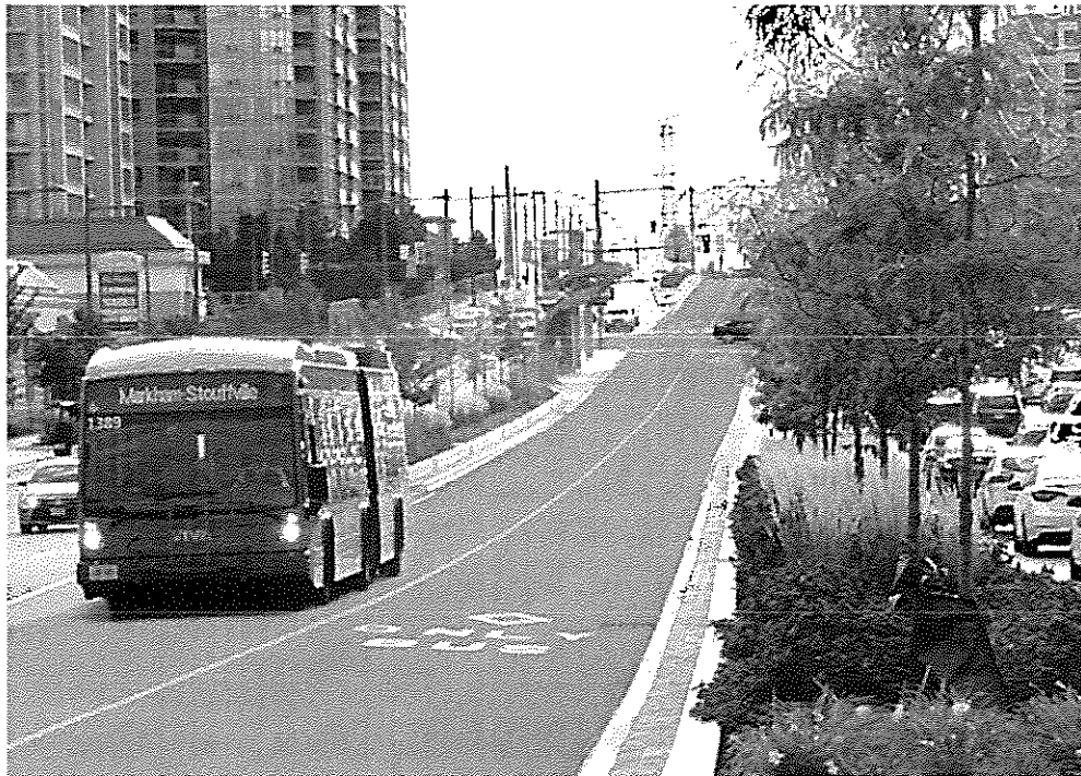
Highway 7, east rapidway looking west to Valleymede Station

Since rapidways are located in the centre lanes of the corridor, left turn movements must operate with their own separate signal phase or be restricted to ensure the safety of vehicles crossing the rapidway lanes. Given the width of the roadway, pedestrians may be required to cross in two phases, stopping on the landscaped median between them.