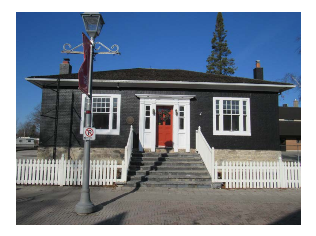
The Eckardt-Stiver House, c.1829, 206 Main Street Unionville