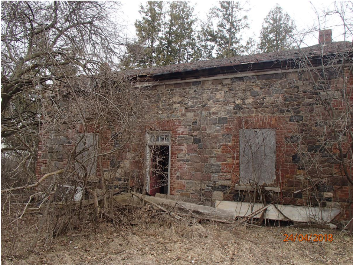
Figure 3 – Building Photograph 2018