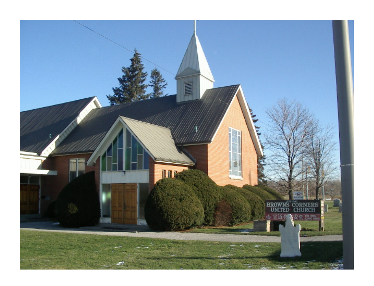
Brown's Corners United Church, 1899. Remodelled 1961