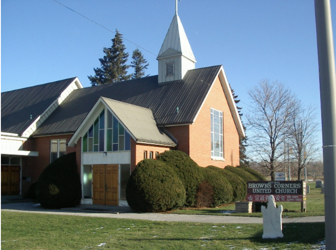
Brown's Corners United Church, 1899. Remodelled 1961