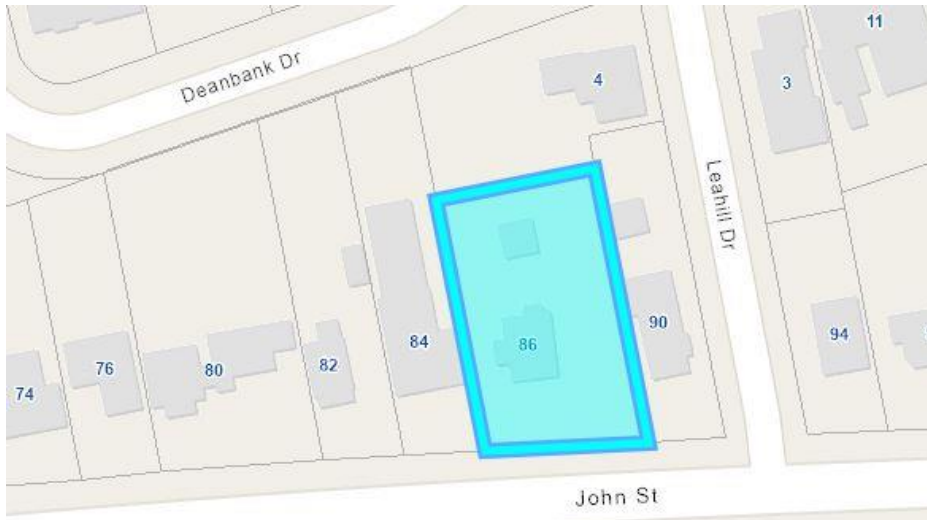
Property map showing the location of the Subject Property [outlined in blue]