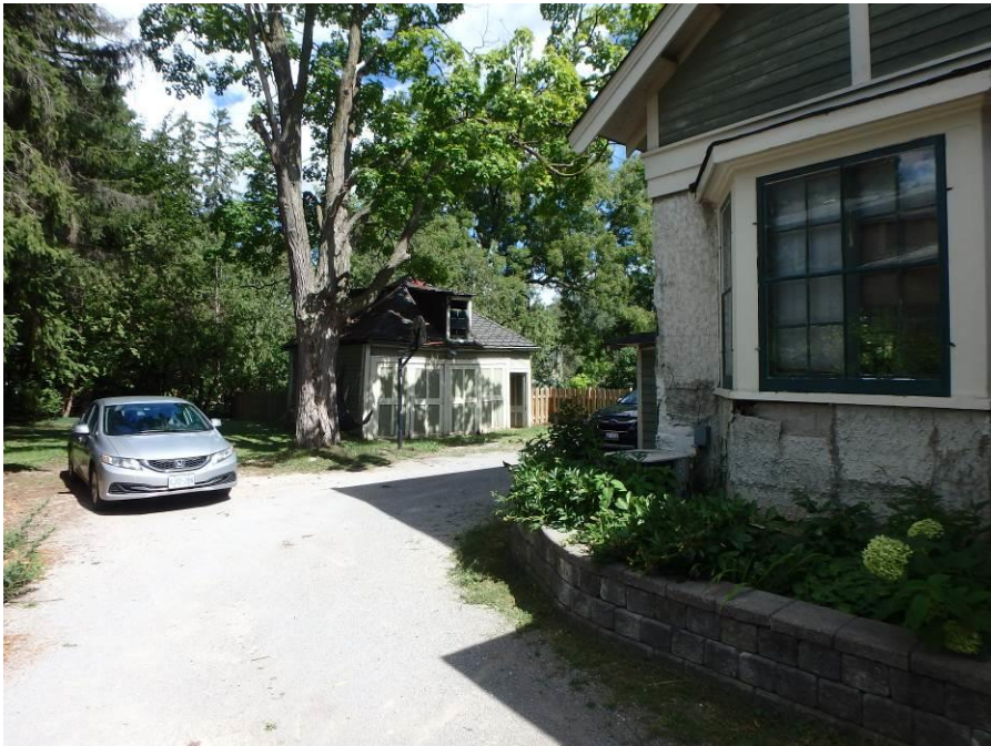
Existing garage in the rear yard of the Subject Property