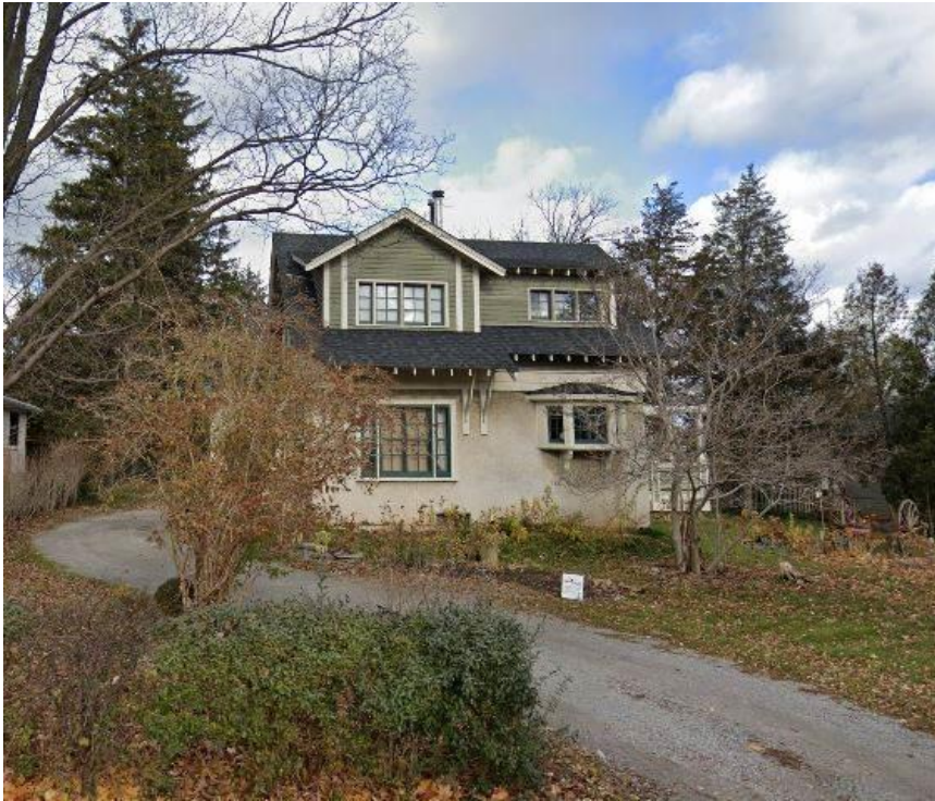
The south (primary) elevation of heritage dwelling on the Subject Property