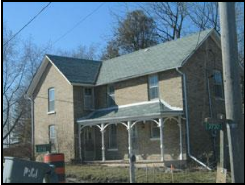
Levi Heise House