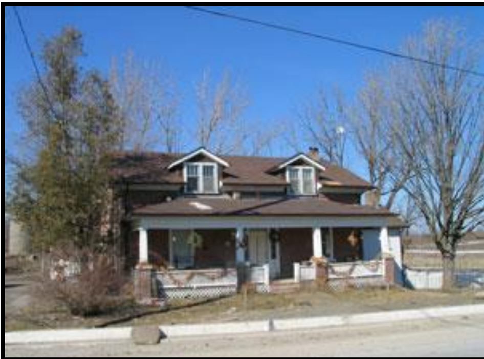
Christian Heise House