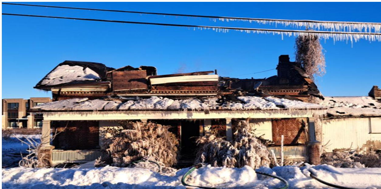
Aftermath of Fire.