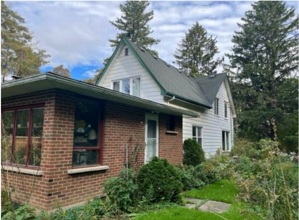
The east (primary) elevation [above] and the west/south elevations of the on-site dwelling [below] as seen in October 2023