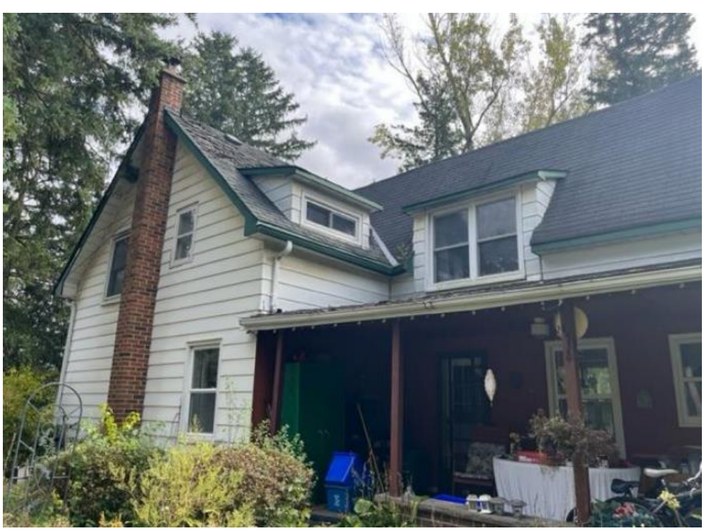
The north elevation of the on-site dwelling as seen in October 2023