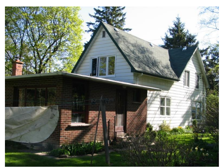
7696 Ninth Line. West and south side view showing rear wing and 1960s addition.

The side porch has a simple shed roof supported on slender square wooden posts. It does not appear to be very old, but it could occupy the same space as an earlier porch that may have existed in this location. There is a single-leaf door within the side porch, at the east end of the north wall of the rear wing.